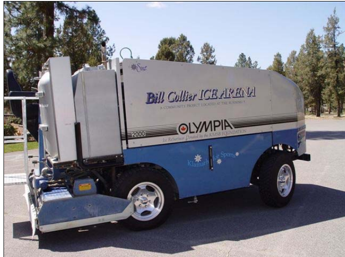
The Suz at The Bill Collier Ice Arena in Klamath Falls is powered by natural gas