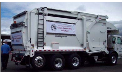
Rogue Disposal brought a demo CNG truck to the fleet conference sponsored by Rogue Valley Clean Cities Coalition last June. The 2012 fleet conference is set for February.

American manufacturer Knapheide, a Clean Cities partner, has been at the forefront of engineering to modify service bodies to accept a CNG uplift. Rogue Sewer Services chose a design with the tank in a transverse compartment behind the cab. Knapheide makes bodies for other types of vehicles, including flat beds, dump trucks, cranes and utility trucks. "The rest of the body looks like a standard utility bed with compartments for tools and supplies," Gary Worden said. "You won't even be able to tell from the outside that it's a CNG body." Learn more from the website www.roguevalleycleancities.org