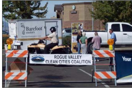
Jackson County Roads loaned traffic control signs and cones.